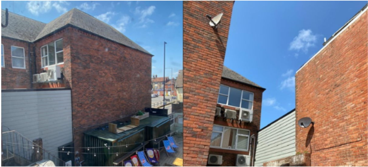
Proposed bedroom window in relation to acoustic barrier to the Brown Street Venue